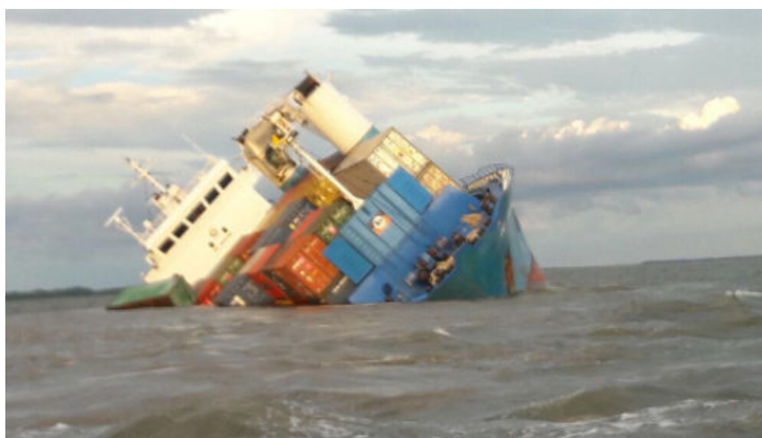
Isla Bartolomé February 23, 2017