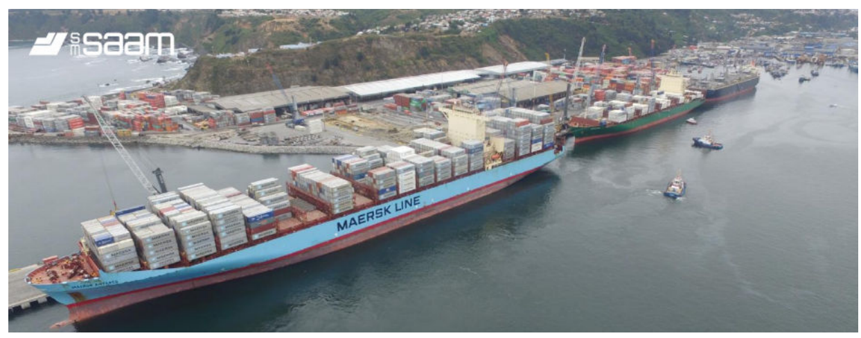
San Vicente Terminal Internacional (SVTI) March 2017.